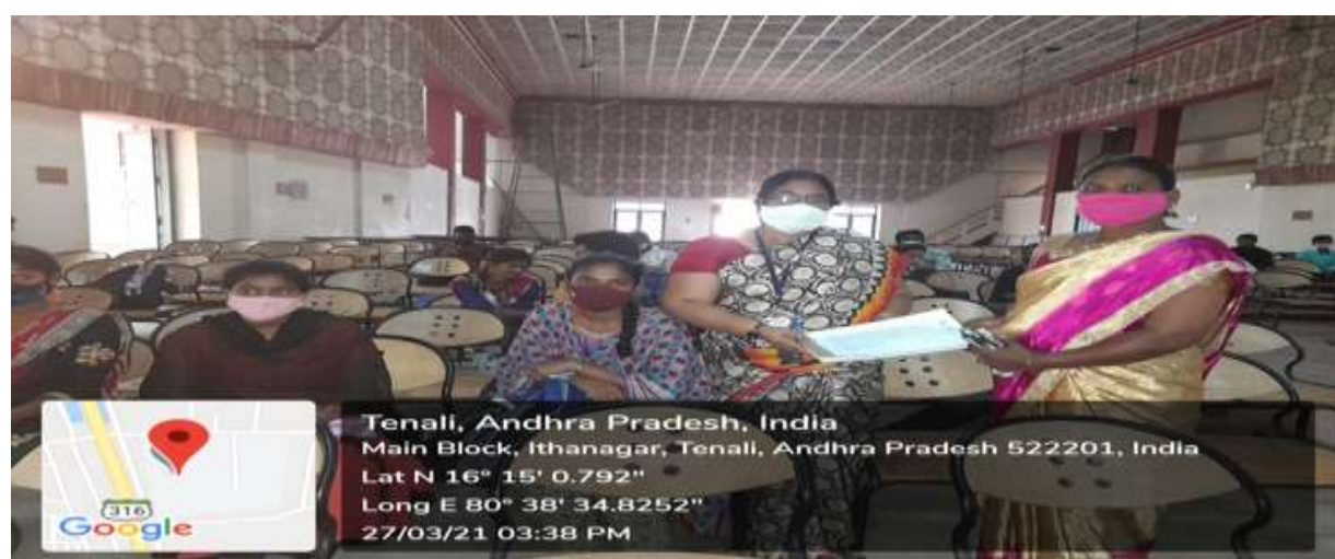
Collecting feedback templates from the stakeholders.