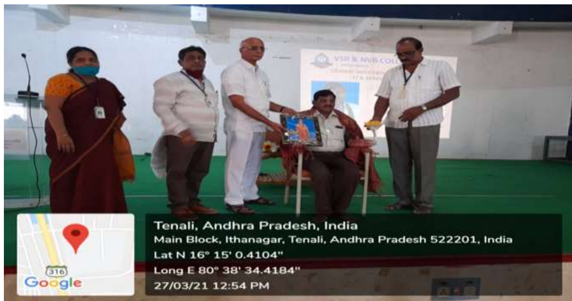
Felicitating the guest