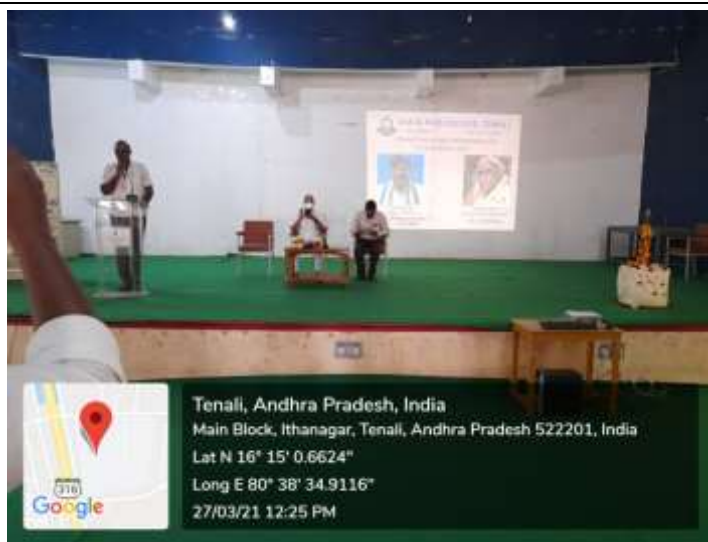
Inaugural speech by the Principal