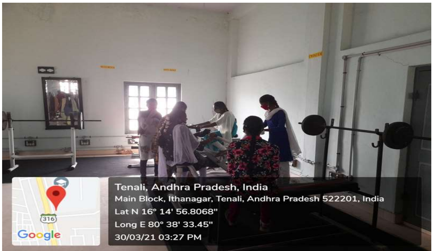
Newly admitted students watching the seniors busy in the multy-gym.