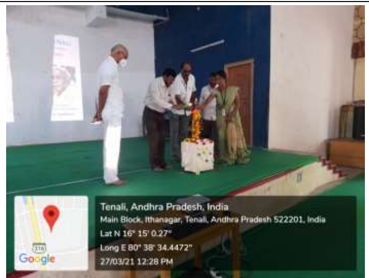
Lighting of the lamp by VIP'