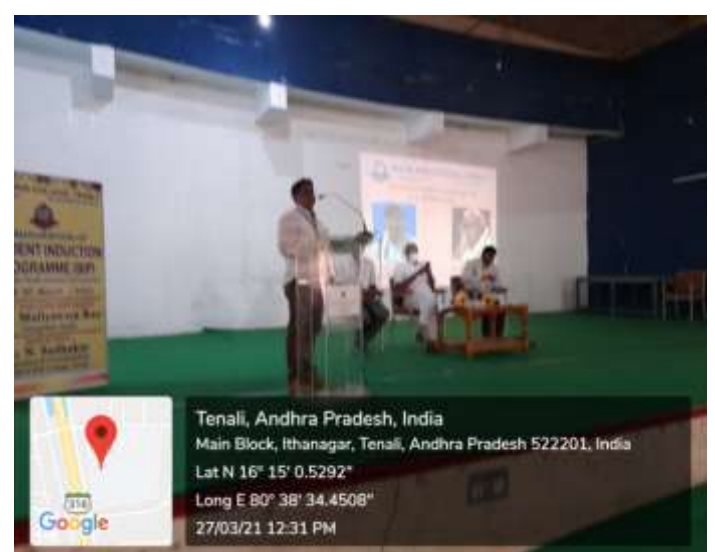
keynote address on human values the by the Chief Guest .