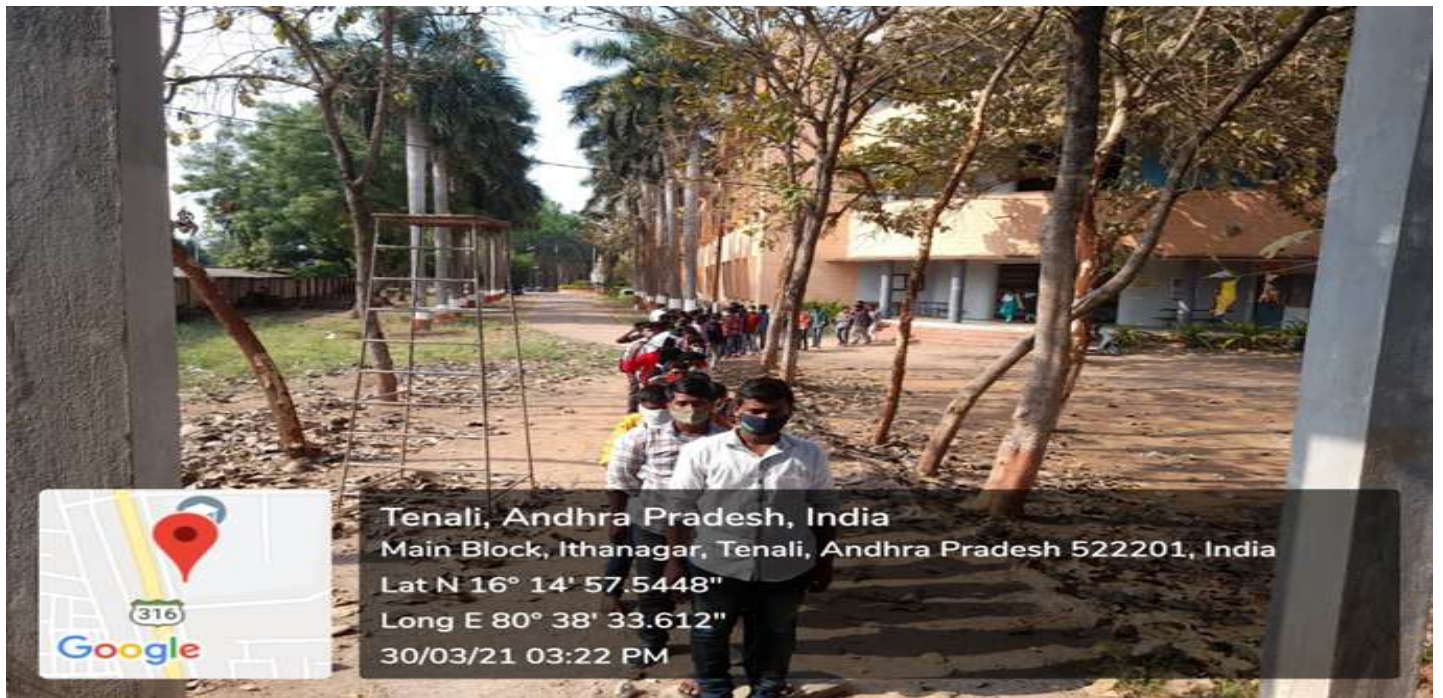
Walking towards the Department of Physical Education and its infrastructure