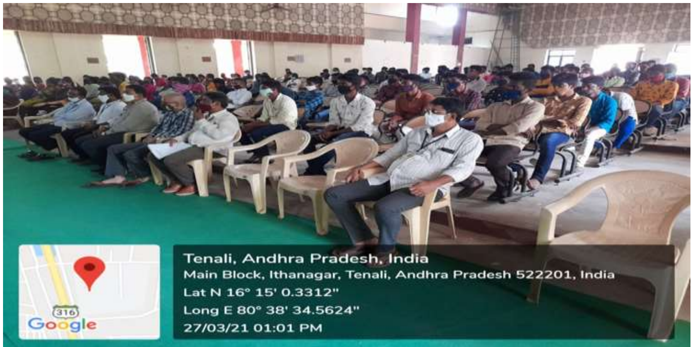
Audience listening to the speaker's spell-bound