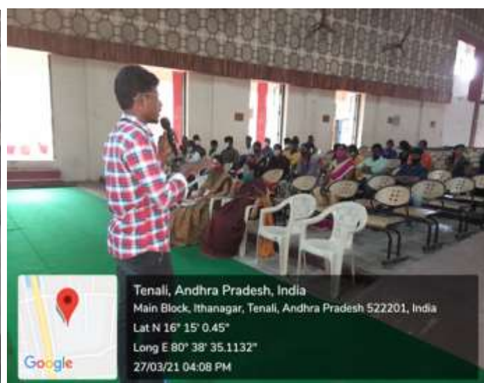
Oral feedback from the new students.